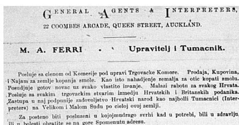
Figure 2. Advertisement in Napredak (1899) for M. Ferri's agency

In the second half of the twentieth century and at the beginning of the twenty-first century, Croats did not have problems with the English language, so their information needs could be satisfied through information published in English. According to the 2014 census, there were 2,637 Croats in New Zealand (0.06 per cent of the New Zealand population). Geographically, 68 per cent of them live in the Auckland region, 8.8 per cent in the Northland region and 8 per cent in the Wellington region. Half of the Croatian population in New Zealand speak more than one language (the percentage for the whole New Zealand population who speak more than one language is 20 per cent). Significantly, a 75 per cent of Croatian children (under the age of 15) speak only one language – presumably, English.