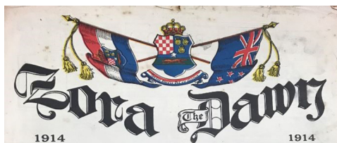
Figure 1. The title of Zora (the Dawn) on the title page of an issue from 1914

The United Front was published by the Slavonic Council between 23 January 1942 and 10 July 1942. A total 20 issues of The United Front are available in the Alexander Turnbull Library in Wellington. The Slavonic Council was organised by delegates appointed from